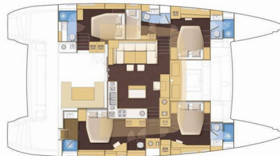
Version 5 cabins / 5 cabins version